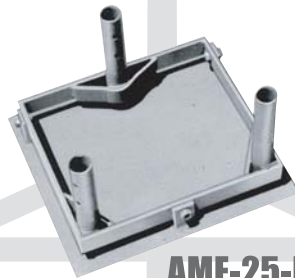
AME-25-BH Hinged Ground & Roof Plate