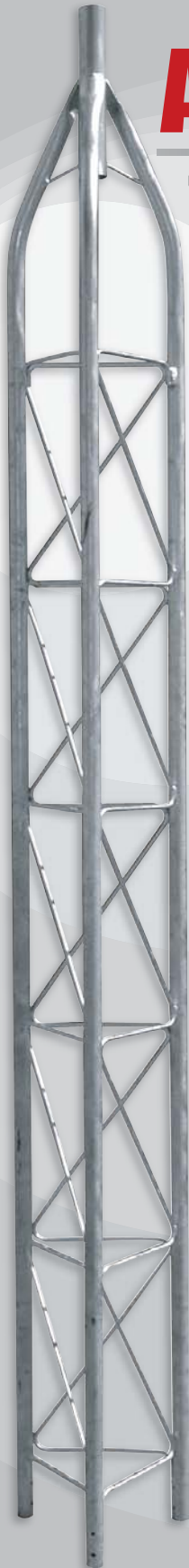
AME-25-T 9' Top Section