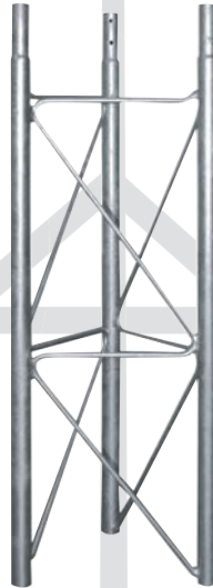
AME-25-B3 3'4" Base