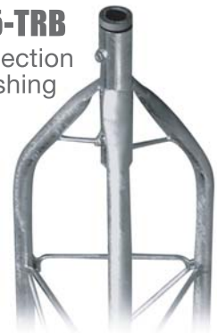
AME-25-TRB 9' Top Section with Bushing

The American Tower Company • 5085 St. Rt. 39 West • Shelby, OH 44875 • 419-347-1185 www.amertower.com