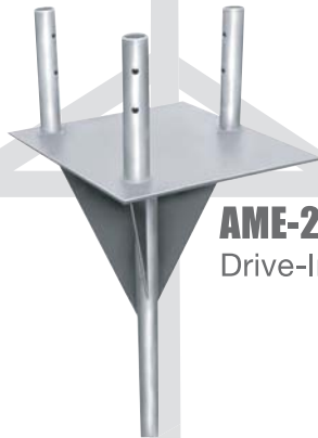
AME-25-DIB Drive-In Base