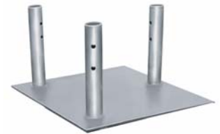
AME-25-BGR Ground & Roof Plate